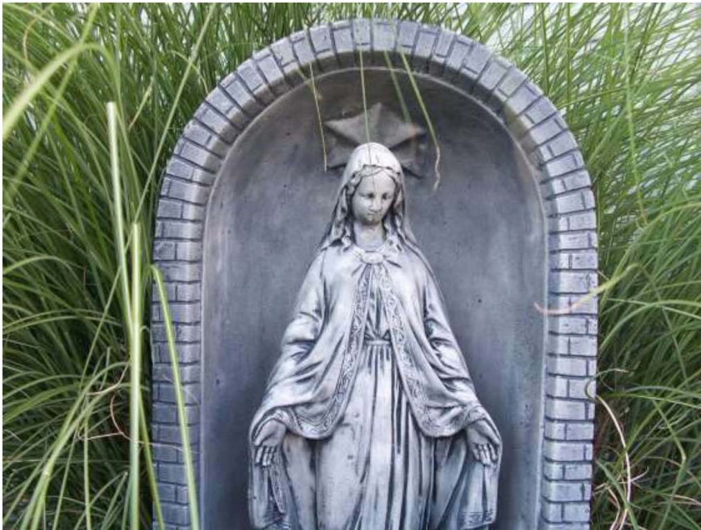
Our Lady Star of the Sea